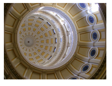
to be heard at the state capitol.

discussing salary for administrators of low-performing schools. Colorado school boards already have to comply with numerous regulations regarding financial transparency and budget public hearings.