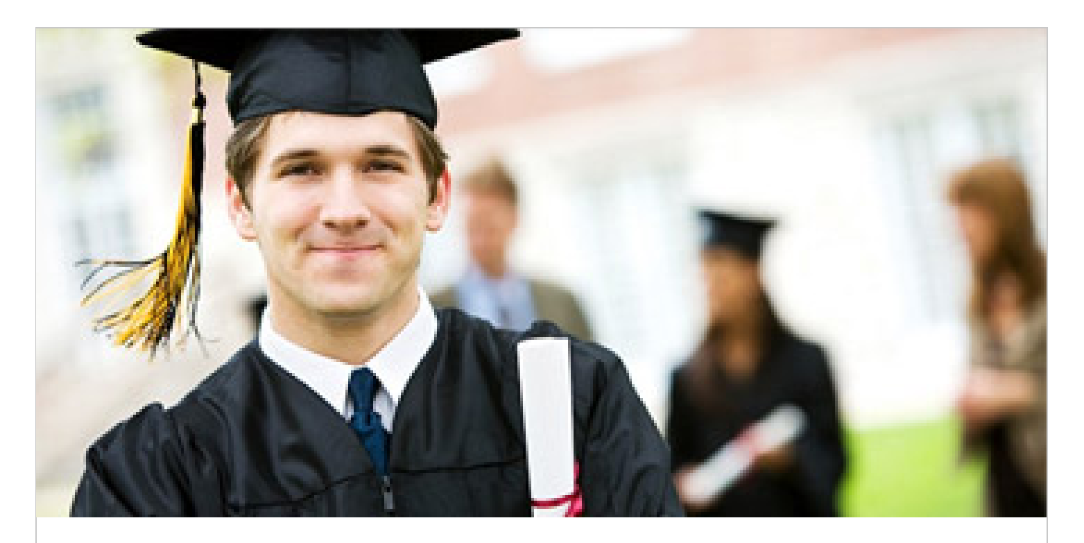
Strengthening America's Higher Education System